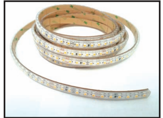
Polymer encased for IP65 applications.